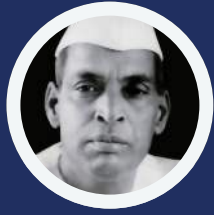
Loknayak Shri Manikya Lal Verma